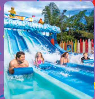
LEGOLAND WATER PARK