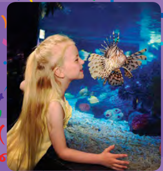
SEA LIFE® AQUARIUM